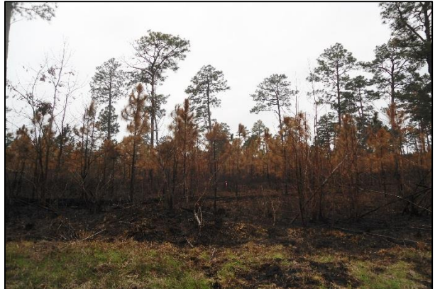
Mixed pine stand burned to promote longleaf pine, Houston County, 323 acres.