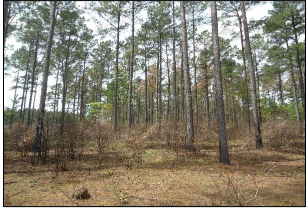
Mature loblolly pine stand, Trinity County, 119 acres.