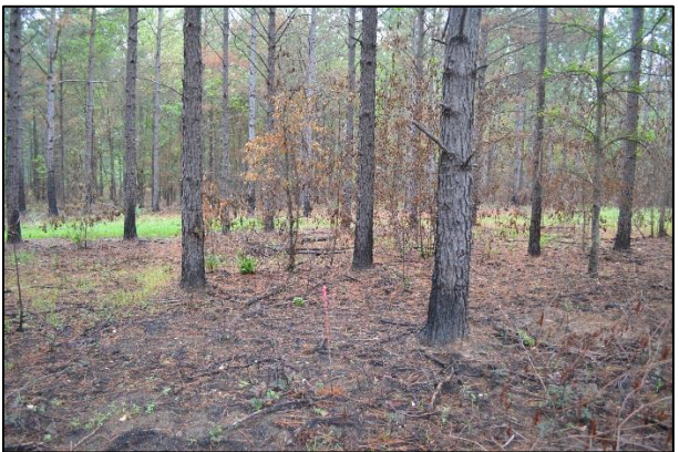
Mid-rotation loblolly pine stand, Harrison County, 379 acres.